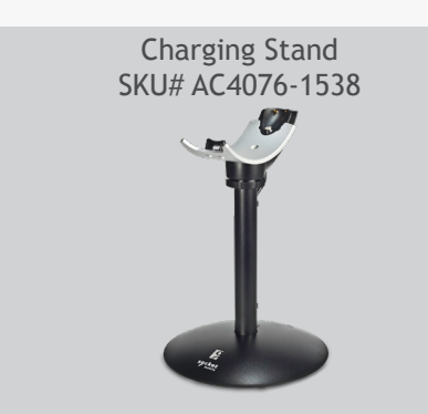
Great for using AutoScan Mode