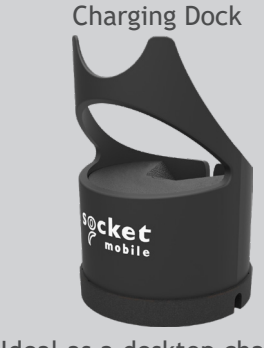
Ideal as a desktop charger