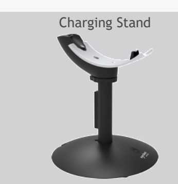
Great for using AutoScan Mode