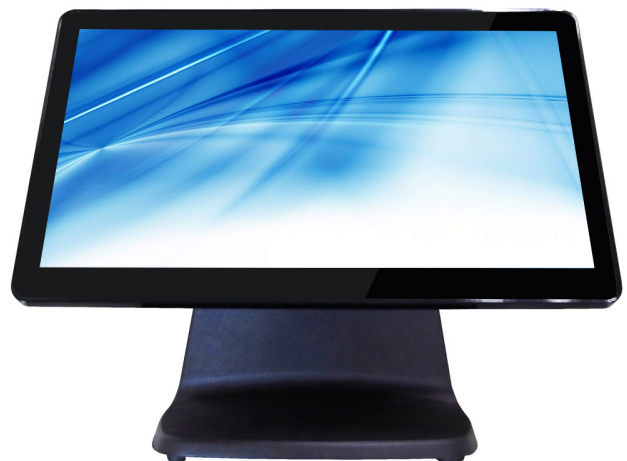
TRUE FLAT PCAP MULTITOUCH SCREEN