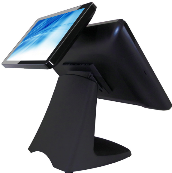
2ND LCD DISPLAY

Element CA250W is a modular 15.6" bezel free wide-screen all-in-one Windows 10 IoT POS Terminal. The aesthetic design of the chassis and stand with the seamless integration of modular peripherals such as MSR, Second Display and Customer Display make it the perfect unit for the retail and hospitality industries.