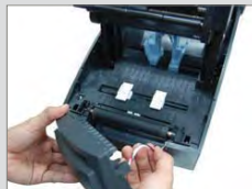
Auto-Cutter : Easy installation